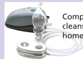
Complete Diffuser cleans the air at home and office.

Diffusing is the most effective way to fragrance your home with essential oils. Try either the Ultrasonic Diffuser or the Complete Diffuser for the finest, longest-lasting mist. Prefer a low-tech approach? Place a few drops of essential oils in the Travel Fan, press the button and you're on your way to healthier indoor air.